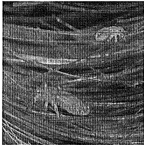
Image of real lice